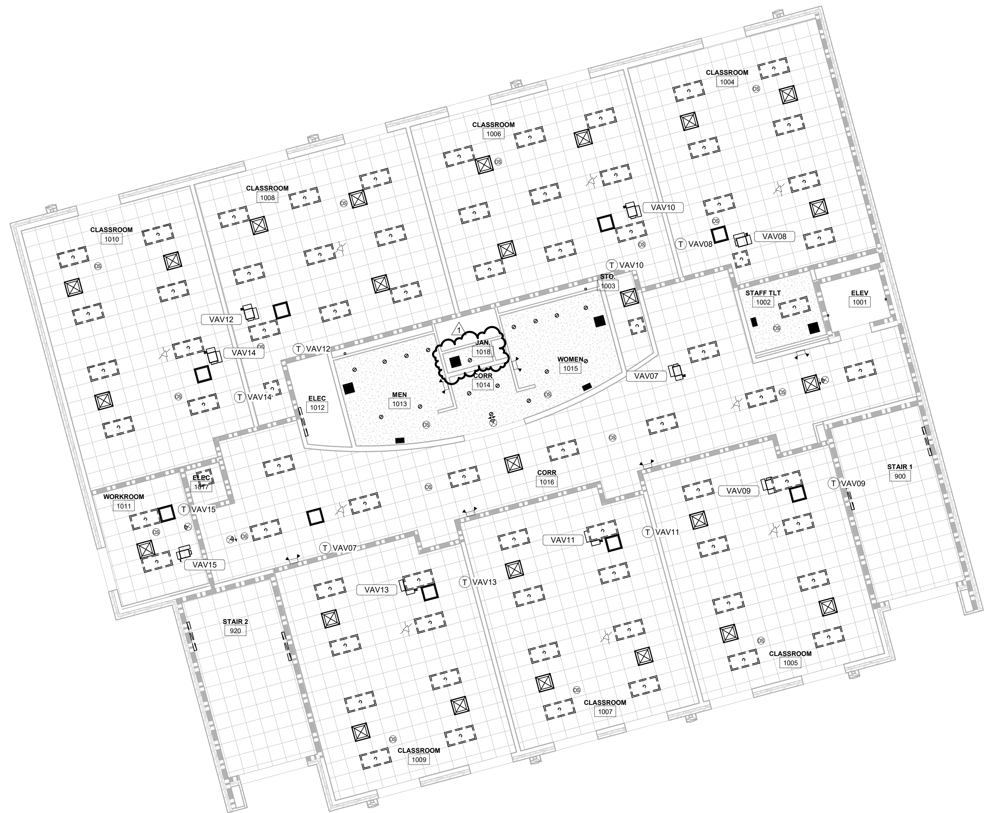
CLASSROOM BUILDING SECOND FLOOR PLAN - HVAC RCP AND T-STAT LOCATION